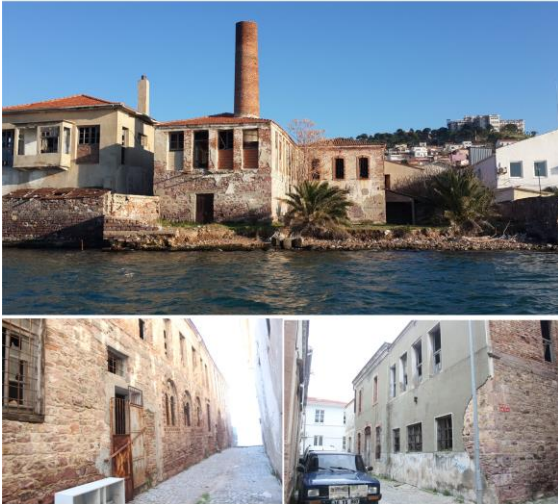
Figure 3: Ertem Olive Oil Factory, top: view from the sea; bottom left: the most elaborated façade; bottom right: entrance façade

Ertem Olive Oil Factory (See Figure 3) is one of the industrial heritage buildings in Ayvalık dating back to 1910 constructed before the population exchange -1923- by a Rum named Anastasyos Yorgolos (Efe et al., 2013: 65). The factory was used by several owners for producing olive oil and by-products. In 1952, the ownership of the factory took over to Ertem Brothers who give the name to the factory itself. Ertems who immigrated from Crete in 1924, was settled in Ayvalık after the population exchange. They were one of the important families that come from olive trade originated family and they operated the factory until 2000 (Efe et al., 2013: 65). Today, the ownership of the factory belongs to a Turkish Doctor who lives in the USA. It is abandoned and under the risk of destruction due to the factors of human and nature since 2000.