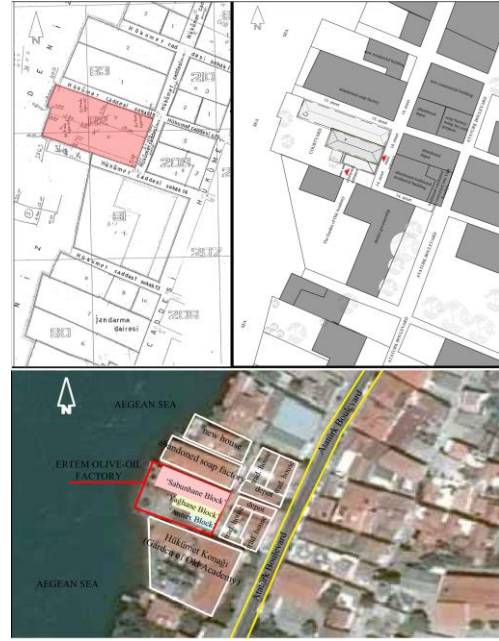
Figure 4: Top Left: cadastral plan (obtained from municipality); Top Right: site plan (prepared by the author, 2016), Bottom: physical layout of the building (Google Earth image, 2016 is digitally manipulated by the author)

The building lot (See Figure 4) which is located on 14. Street, Sakarya District in Ayvalık/Balıkesir-Turkey, covers an area of 1125 m 2 , of 582 m 2 which is occupied by the factory. The factory is located at the north-east part of the lot. It is composed of three blocks (See Figure 5) adjacent to each other. The main entrance to the factory is provided from 14. Street, from the middle block named as '2nd Block'. The courtyard entrance is also provided from 14. Street, through a courtyard door that is adjacent to the factory.