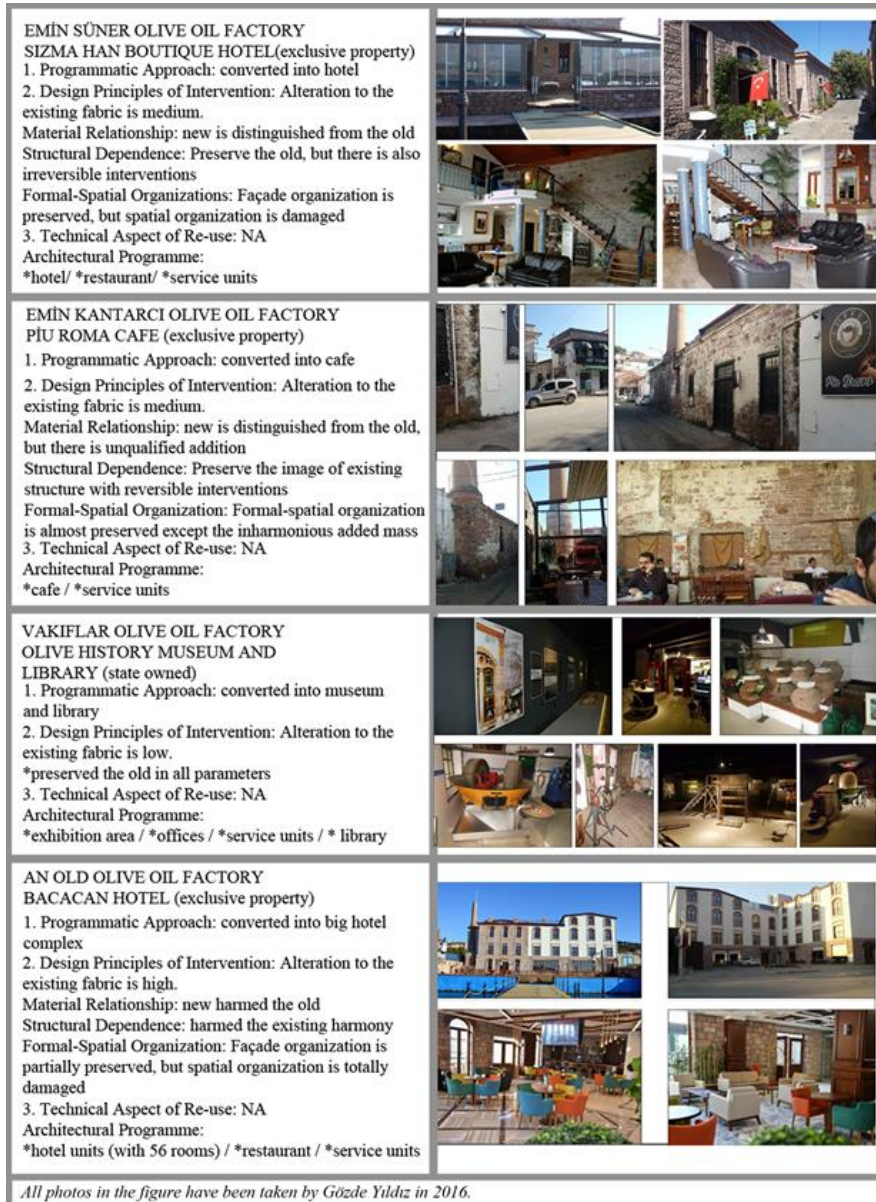
Figure 2: Selected Ayvalık Adaptive Re-use Examples for the evaluation of the site within the scope of the study.

From the programmatic point of view, it can be said that most of the examples make a contribution to the site in order to provide the sustainability. Moreover, the intention of giving the museum example (Formerly, Vakıflar Olive-Oil Factory) is to understand the site demands towards developing a conservation approach for Ertem Olive Oil Factory. Because, while giving a function as museum, the necessity of it for the site should be analyzed. Thus, in Ayvalık, there is a museum of olive history that one can see the production processes, primitive and 19th-century processing tools, information about family enterprises. In addition to Olive History Museum, there is also Rahmi Koç Museum in Cunda (Formerly, Taxiarchis Church).