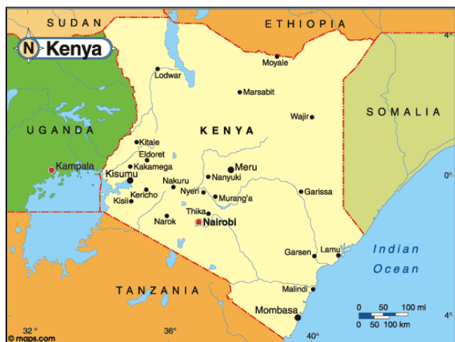
Figure 1: Kisii Town location in Kenya

According to the Constitution of Kenya ( The Republic of Kenya, 2010 ), the CGOK operates under legislative and executive arms. While the legislative arm makes county legislation, the County executive, in contrast, implements the national and county legislation, including managing and coordinating the functions of all devolved county departments. This indicates that once the County legislature has pronounced itself in a way of passing applicable legislation on planning and development control, it is the responsibility of the County executive which is headed by the Governor to undertake monitoring and enforcement.