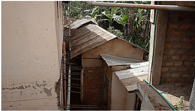
Figure 3: Noncompliance with rear setback planning standard in Daraja Mbili

In the above occurrence, the entire 4.5 metres rear setback has been used to develop servant quarters and stores, oblivious of the important role that it provides. A challenge is bound to arise in case of emergencies such as those associated with fire disasters. This undermines development control principles of safety, access, convenience, and aesthetics, consequently signifying inadequate development control.