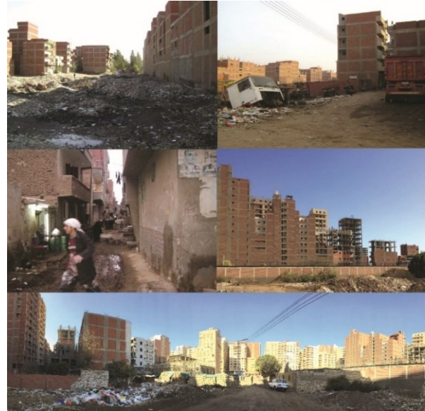
Figure 2. Illustrates some cases of violations.