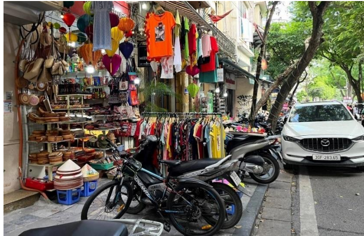
Figure 6. The sidewalk is occupied by parked vehicles and personal activities.