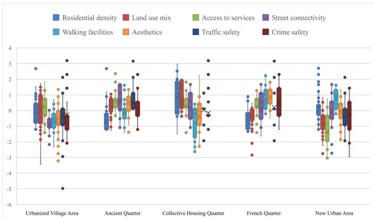
Figure 3. Z-score of perceived urban design for five urban typologies (developed by Authors).

Note: boldface font indicates the maximum values, and italic font indicates minimum values.