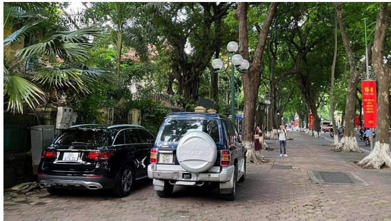
Figure 5. Parking violations on sidewalks.

the availability of the network. A study of 800 students in Hanoi revealed that motorcycle ownership, part-time employment, and fear of sexual harassment (among women only) are some of the reasons that led students to quit riding buses (Nguyen & Pojani, 2022). Participants agreed that stores are within walking distance from home in most neighbourhoods, reflecting the vibrant commercial activities along streets in Hanoi. Participants also reported that it's not difficult to park their vehicles in Hanoi, which seems to be an unexpected result in a high-density city like Hanoi. However, it should be noted that illegal parking is very popular in Hanoi (see Figure 5), especially in the CBD area (Thanh Truong & Ngoc, 2020; Vu, 2017). A study by Vu (2017) pointed out many reasons for this behaviour including the shortage of parking spaces, low level of enforcement, and high parking charges of legal parking.