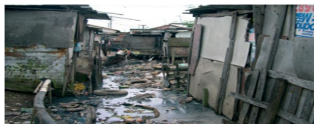
Figure 2. Slum areas that can breed criminal activities in Brazil.

it is popularly said that charity begins at home so therefore the structure of a family on how it runs and perceived by everybody is as important as having a stable society that aims for the best for themselves and others around, also the ability to have a good family plan in order to avoid a very high fertility rate, and finally we have recreational center (it is said that all work and no play make Jack a dull boy) this helps to provide a balance in the sense that having open parks, playing ground and other social centers creates a relaxed and welcoming atmosphere. All this if not properly combated will result to low or lack of safety and security of lives and property which can lead to total breakdown of law and order, it also results to low or lack of social life, this is vital to the balance of human life in order to have a happier life.