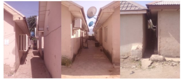
Figure 3. Windows of houses opening into a narrow lobby with insufficient setbacks between buildings, causing insufficient airflow for adequate ventilation.

houses was 28.9 °C and the mean relative humidity was 40.7%. These values exceeded by slight the difference compared to the values suggested by ASHRAE, which is between 21 – 26 degrees Celsius (temperature) and 30 - 70 percent (relative humidity) (ASHRAE, 1992). The slightly higher than the recommended value of the indoor temperature could be a result of inadequate window openings and in the appropriate window placement on the buildings for sufficient ventilation. This indicated that most of the occupants are not thermally comfortable coupled with the challenge that the majority of the occupants earned below $50/month and as such unable to afford to pay for the energy required to make their houses comfortable.