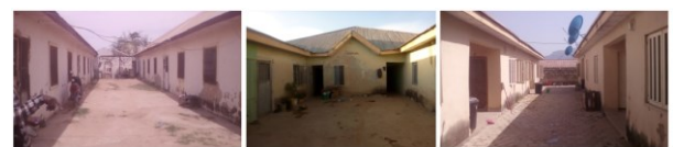
Figure 2. Houses were built within fence walls and around the courtyard allowing windows to be opened.

To determine the susceptibility of the houses to ill-health based on their indoor CO 2 and PM 10 /PM 2.5 , the overall mean concentration of CO 2 obtained was 584 ppm. This was less than 600 ppm, which indicates on the range (for acceptable value) that the ventilation was adequate. Although some of the houses exhibited adequate ventilation, the reason for this could be a result of multiple interacting factors such as the way the occupants operated their buildings, many houses were built within fence walls and around a courtyard (Figure 2), hence, households were able to leave their windows opened for long hours both night and day.