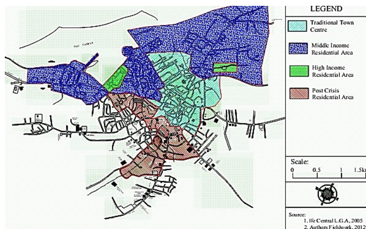
Figure 2. A map of Ile-Ife and its residential zones.

There are four types of residential areas that can be identified in Ile-Ife. These are the core, post-crisis, transition (middle-income), and sub-urban (high-income) residential zones, as presented in Figure 2. The physical planning of the core residential zone (pre-colonial development) is primarily rooted in the culture of the people. The core residential zone is set up like the traditional core area of other Yoruba towns, with the royal palace, town square, sacred groves, and the king's market (Oja-Oba) at the heart of the area.