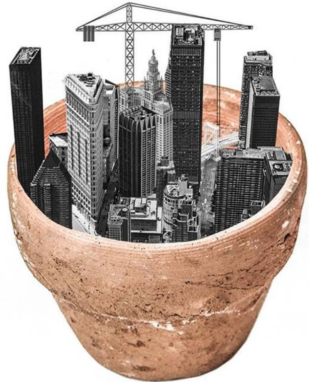
Figure 4. An Urban Area in A Pot, By Serap Sonmez (Sonmez, 2018)

Looking at the below image of a potted city and imagining the replantation of these structures in a forest resembles a violent action similar to agriculturalization of forest lands, or passing huge pipelines from the middle of forests or more similarly dumping construction wastes into forests.