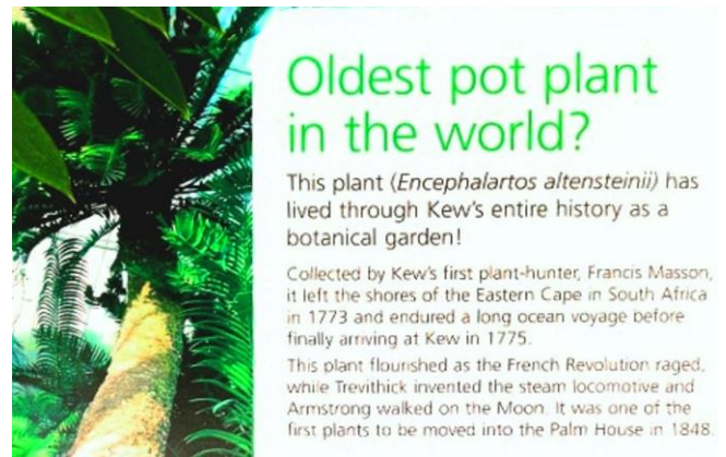
Figure 2. The oldest potted plant in the world is in the "living laboratory" of the Royal Botanical Gardens in Surrey

The variety of chemicals produced and used to create a "protective" environment for the potted plants and support their artificial health such as pesticides and insecticides, fungicides, paints and sealants, anti-desiccants, disinfectants and sterilizers and deterrents (Beckett and et al, 1983). To keep them alive for a long period, it is necessary to keep them in laboratory conditions, and continuously re-pot them (Figure 2).