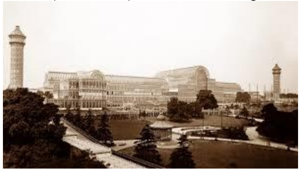
Figure 3: The Crystal Palace in Hyde Park for Grand International Exhibition of 1851.

exhibition space. The construction, acting as a self-supporting shell, maximized interior space, and the glass cover enabled daylight. The method of construction was a breakthrough in technology and design, and paced the way for more sophisticated pre-fabricated design.